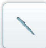
Data Request Form

EASSDA membership is available only to individuals. Individual members include students, scholars, and researchers. To become a member, please fill out the Registration Form .